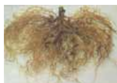
Nitrogen in uncoated urea available to plant roots for only 70-90 hours