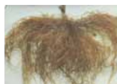
Nitrogen in coated urea available to plant roots for 20 days and above