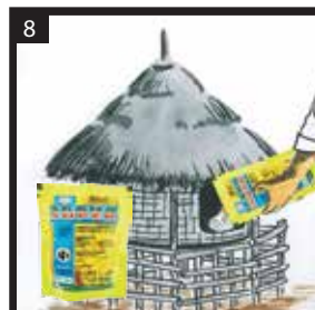
8 Dust the granary/store before placing the treated bags or grain. Repeat treatment after six months.