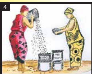
4 Winnow the maize to remove debris, dust and broken seed and retain the clean seed.