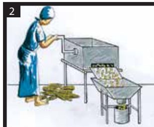
2 Shelling can be done manually or mechanically.