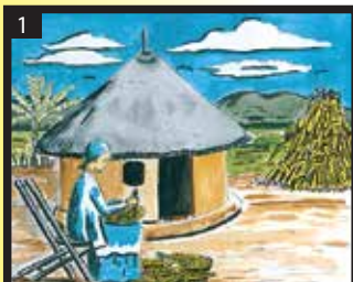
1 Harvest the maize when ready and shell the cobs.