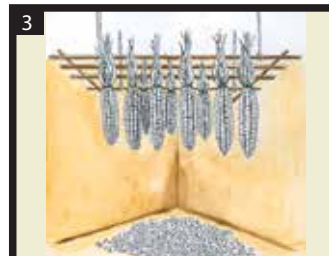
3 Ensure the maize is well dried.