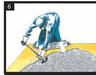
6 Thoroughly mix Skana® Super Grain Dust with the grain to ensure uniform mixture.