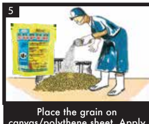
5 Place the grain on canvas/polythene sheet. Apply the recommended amount of Skana® Super Grain Dust (50gm for every 90kg bag).