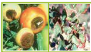
Blossom end rot & Ca deficiency (Tomato) (Peas)