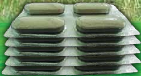
Presentation 5 x 4 boli